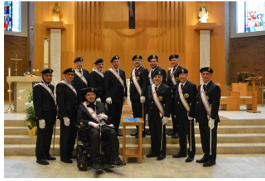
Sir Knights with the Silver Rose